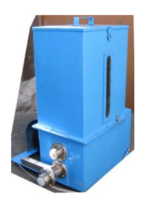
JCCW-30 Type Front Photo