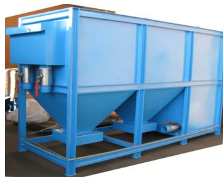
JCCW-30 Type Back Photo