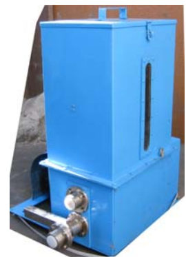
Injector (50kg) Photo

Manufacturer - Retailer: J & C Corporation