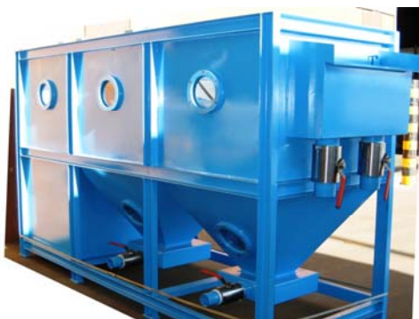
JCCW-30 Type Front Photo